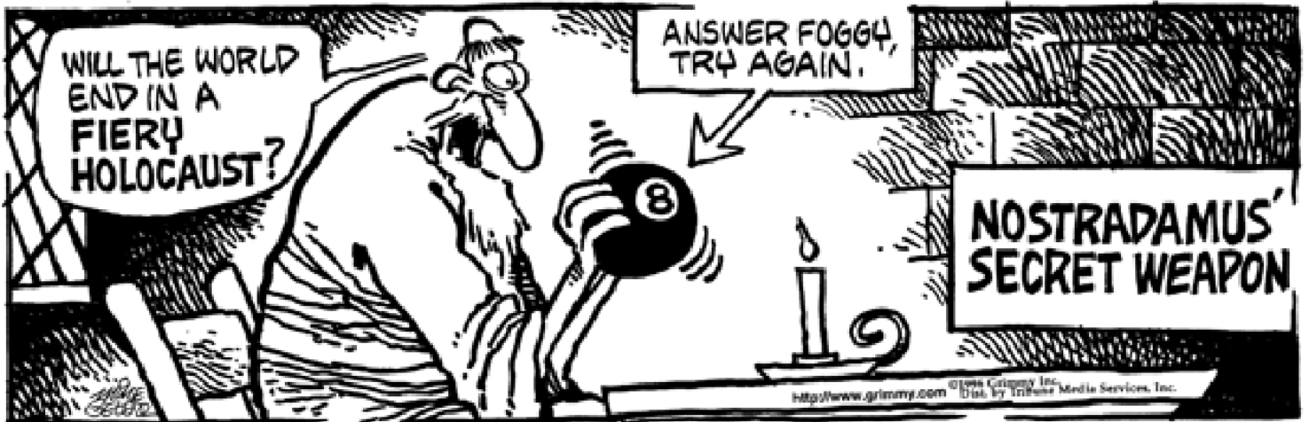
Mother Goose and Grimmy 02/01/96 Grimmy, Inc. © 1996 King Features Syndicate